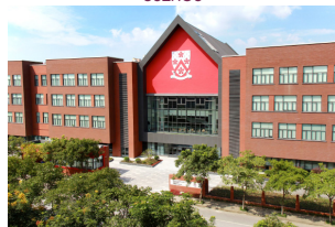
DULWICH INTERNATIONAL HIGH SCHOOL SUZHOU