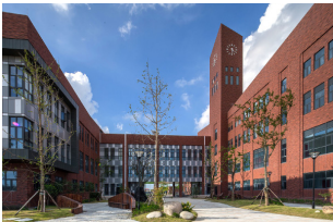
DEHONG SHANGHAI INTERNATIONAL CHINESE SCHOOL