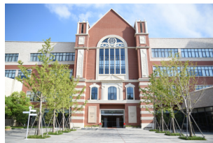
DULWICH COLLEGE SUZHOU