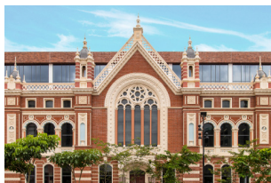
DULWICH COLLEGE (SINGAPORE)