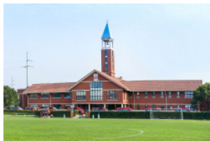
DULWICH COLLEGE SHANGHAI PUDONG