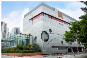
DULWICH COLLEGE SEOUL