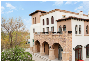
DEHONG BEIJING INTERNATIONAL CHINESE SCHOOL