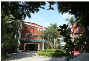
DULWICH INTERNATIONAL HIGH SCHOOL ZHUHAI