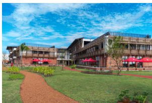
DULWICH COLLEGE YANGON