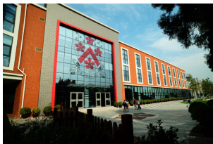
DULWICH COLLEGE BEIJING